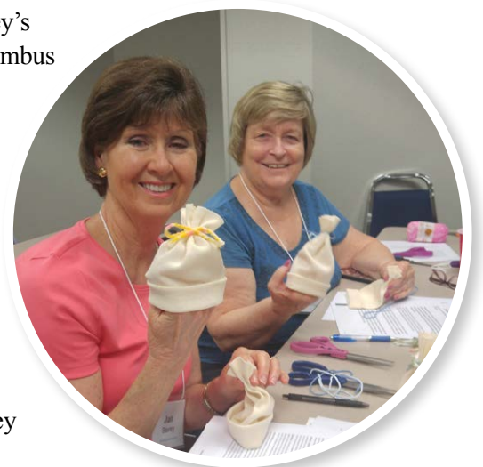
Ladies Auxiliary members make baby caps for Parkland Hospital.

These projects include the annual Light Up for Christ event in December, supporting local crisis pregnancy centers, creating care packages for the homeless,