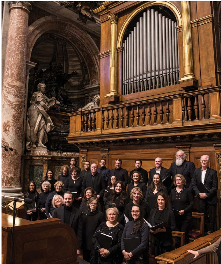
The St. Gregory choir singing for Mass at St. Peter's Basilica.

Rome is an important city for Catholics. Pope Francis is the bishop of Rome, and St. Peter's Basilica, which sits above St. Peter's tomb, is considered one of the holiest churches in the Catholic Church. Twenty-eight St. Gregory Choir members and 24 others were blessed to begin 2020 with a trip to Rome, along with a trip to Assisi. From January 2-9, the group had the beautiful opportunity to visit various holy and famous sites.