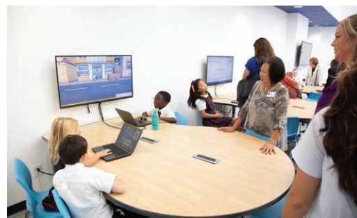
ASCS students show attendees some of the equipment that they would be using in their courses in the innovation lab.

All Saints Catholic School serves students in PreK 3 through eighth-grade and provides a faith-filled, nurturing environment coupled with a rigorous academic program. The small-classroom setting enables teachers to work closely with students to achieve excellence in faith, academics, service and character. All Saints is a two-time recipient of the National Blue Ribbon School of Excellence Award, and graduates of All Saints are consistently ranked in the top of their high school class.