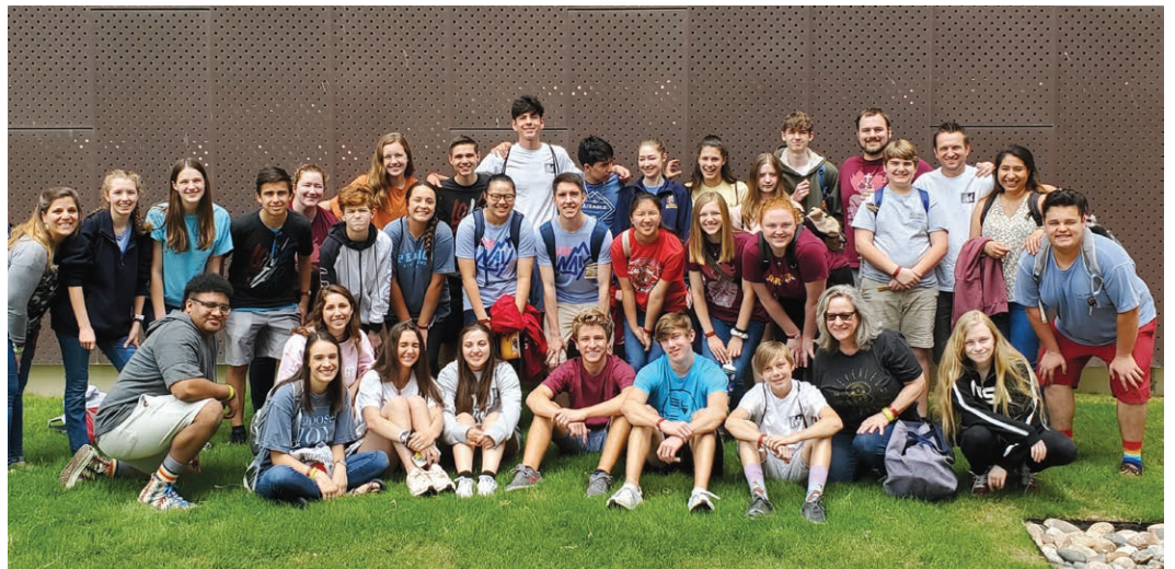
Youth enjoy time together at one of All Saints’ annual high school retreats.