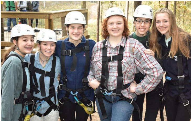
One of the many blessings of youth ministry is it helps young people develop a sense of belonging here at the parish.