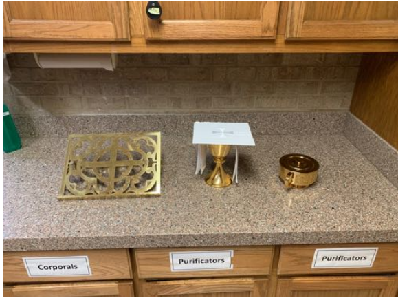
Figure 3b working sacristy counter, St. Joseph side, before Mass