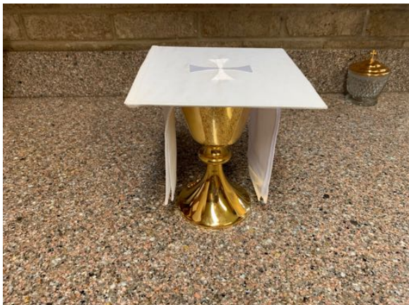
Figure 8c Fr Jovita's chalice