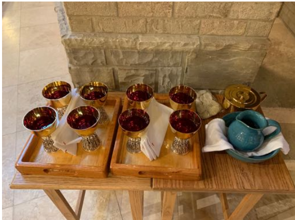
Figure 4a small tables before Mass : trays with cups; bowl, water cruet, towel, empty ciborium for transporting Blessed sacrament