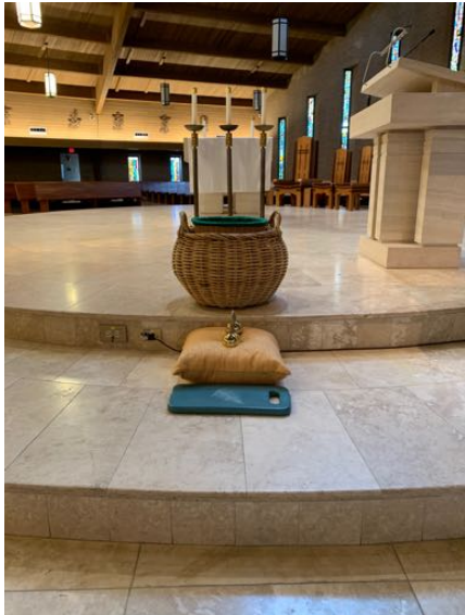
Figure 1b bells & pillow after consecration