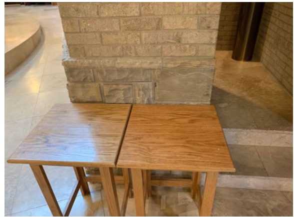
Figure 5a small table after hand washing