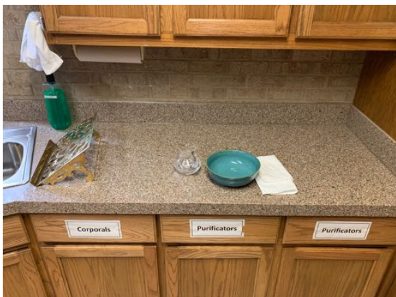
Figure 6c working sacristy counter, St. Joseph side, after Communion