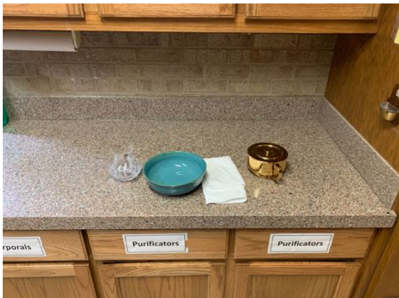
Figure 6b working sacristy counter, St. Joseph side, after hand washing