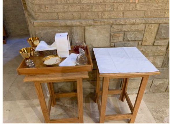
Figure 9 weekday setup; NB: only sacred vessels should be placed on the corporal