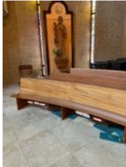
Figure 2 cantor and server pew; facing the pew, seating left to right is cantor, book server, crucifer, candle bearers, thurifer, boat, miter, crozier