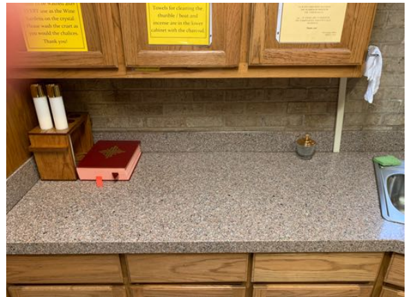
Figure 3a working sacristy counter, Mary side, before Mass