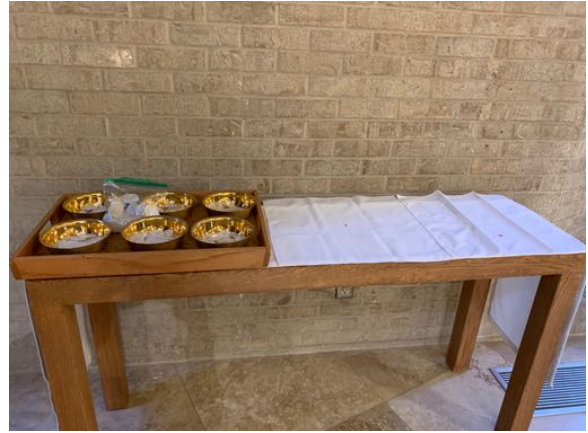
Figure 4b credence table before Mass : tray with ciboria and extra host, corporals NB: only sacred vessels should be placed on the corporal