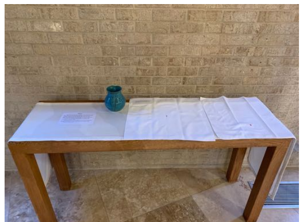
Figure 5b credence table after hand washing ; NB: only sacred vessels should be placed on the corporals