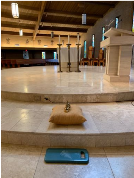
Figure 1a bells & pillow before Mass