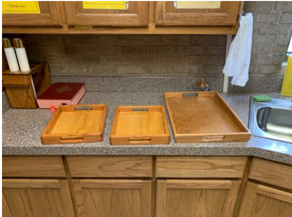
Figure 6a working sacristy counter, Mary side, after altar has been set