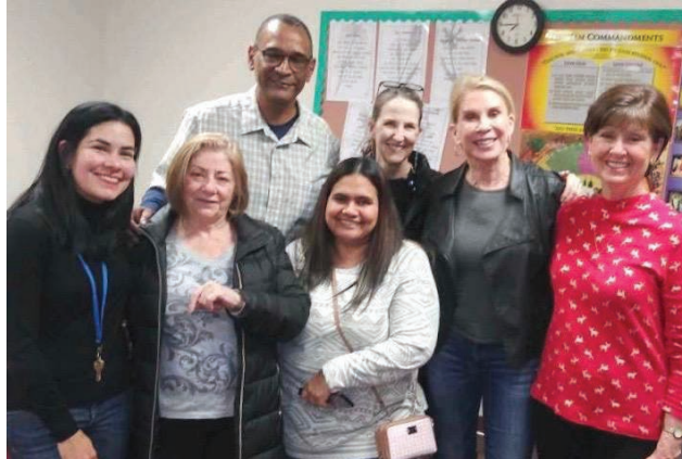
The parish Outreach Ministry serves the community in a variety of important ways.